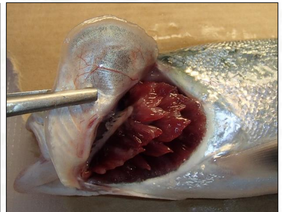
Paramoeba perurans (Terje Steinum, NVI) and Atlantic salmon gills three weeks after bath challenge with Paramoeba perurans .